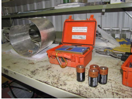
Stingray Level-Velocity Loggers Prepared for Deployment in the Sewage Collection System

An average of one cubic meter a day per household was used as a guide for the amount of water used in a 24 hour time interval. Locations monitored by Stingray Level Velocity Loggers recorded flow rates 15-70% higher than statistical flows. The loggers captured spikes in flow that matched typical run times from domestic sump pumps. Because the Stingray is able to monitor water temperature, Shawn also observed corresponding temperature drops matching the pump cycles. The evidence was clear: residents were connecting sump pumps to the municipal collection system.