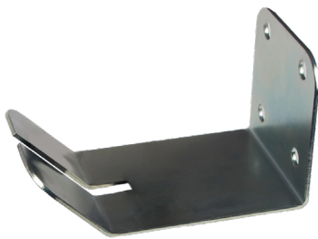
MicroFlow angled bracket

PC software is available to allow setup and run diagnostics using the MicroFlow PC via the RS485 connection. The PC software enables users to be able to set up, test, obtain and record readings from a sensor, giving users an idea of signal strength, stability, device parameters, and much more.