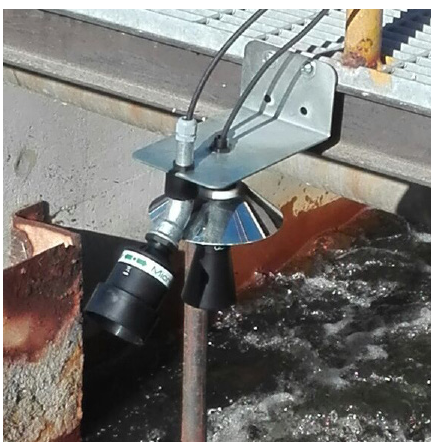
MicroFlow and dBMACH3 in a wastewater application

Thanks to Pulsar Measurement's award-winning and world-leading non-contacting technology, the MicroFlow sensor range does not include any serviceable parts and because it makes no contact with the application, there are no wear and tear issues.