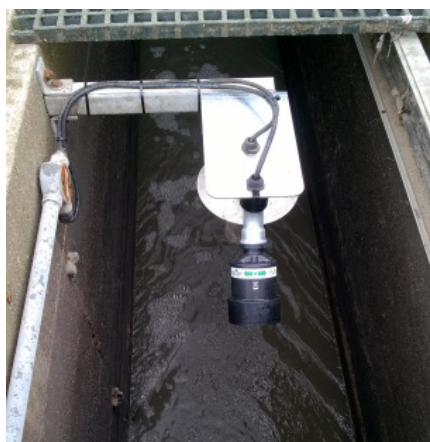
MicroFlow and dBMACH3