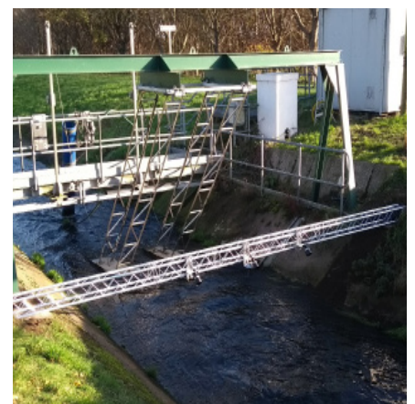
3 MicroFlow's on a wide channel